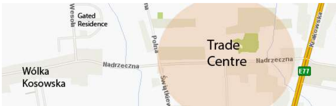
Figure 2. The location of the trade centre in Wólka Kosowska

It is important to note that the centre in Wólka Kosowska is one of a series of such places across Poland. The phenomenon is particularly interesting in relation to suburbanisation or semi-urbanisation. While the appearance of such centres clearly represents an influence of a nearby city on rural areas, their links with the city are rather weak – many employees live on location and rarely visit the city, and the trade targets small entrepreneurs from the region rather than urban populations. The rural area is impacted by the centre’s activities, but does not necessarily become directly connected to the city nor does it always adopt urban characteristics or lifestyles. The concept of urban sprawl (Gillham 2002) seems more fitting to describe this phenomenon as it can be linked to single-use zoning, of which the exclusively economic function of the centres provides a clear example.