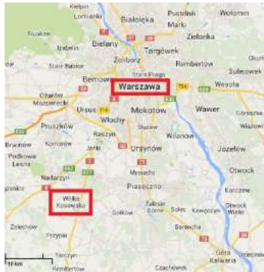
Figure 1. The location of Wólka Kosowska and Warsaw

It is important to note that the centre in Wólka Kosowska is one of a series of such places across Poland. The phenomenon is particularly interesting in relation to suburbanisation or semi-urbanisation. While the appearance of such centres clearly represents an influence of a nearby city on rural areas, their links with the city are rather weak – many employees live on location and rarely visit the city, and the trade targets small entrepreneurs from the region rather than urban populations. The rural area is impacted by the centre’s activities, but does not necessarily become directly connected to the city nor does it always adopt urban characteristics or lifestyles. The concept of urban sprawl (Gillham 2002) seems more fitting to describe this phenomenon as it can be linked to single-use zoning, of which the exclusively economic function of the centres provides a clear example.